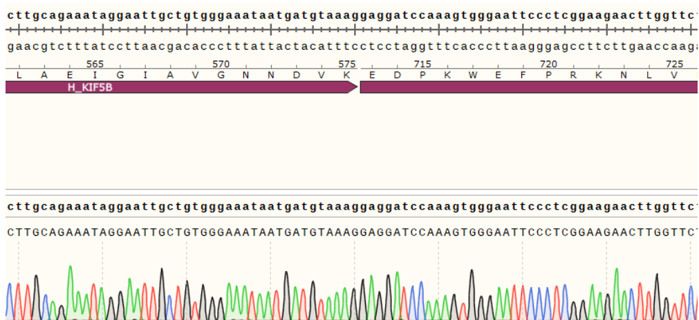
Figure 2 | The KIF5B-RET mutation analysis by Sanger sequencing.